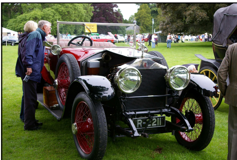
1914 Silver Ghost Tourer, 1UB, by Connaught, being admired at Newby Hall

A few hardy souls attended the Newby Hall rally despite a foul weather forecast. The ground was indeed very soggy with standing water in many places. Nevertheless there was a good turn out of many marques with several Rolls-Royce and Bentley cars on display at different stands around the grounds. The auto-jumble was as big as ever and very popular as usual.